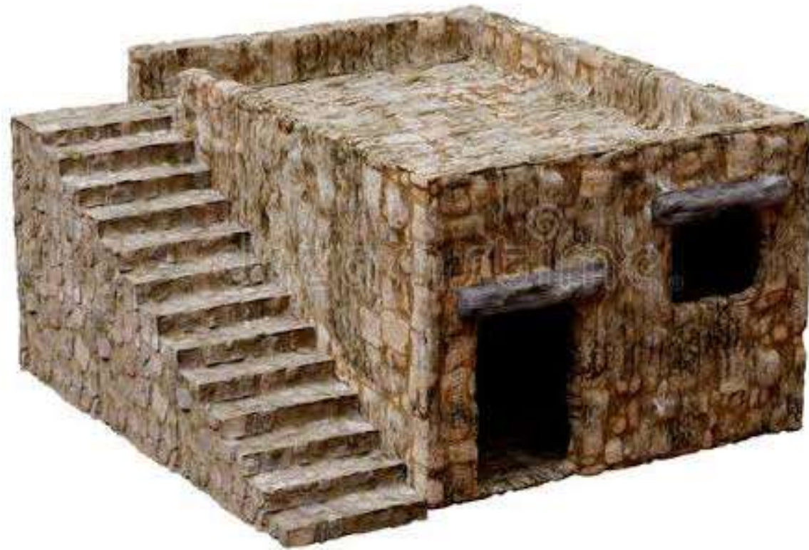
House during Jesus' time