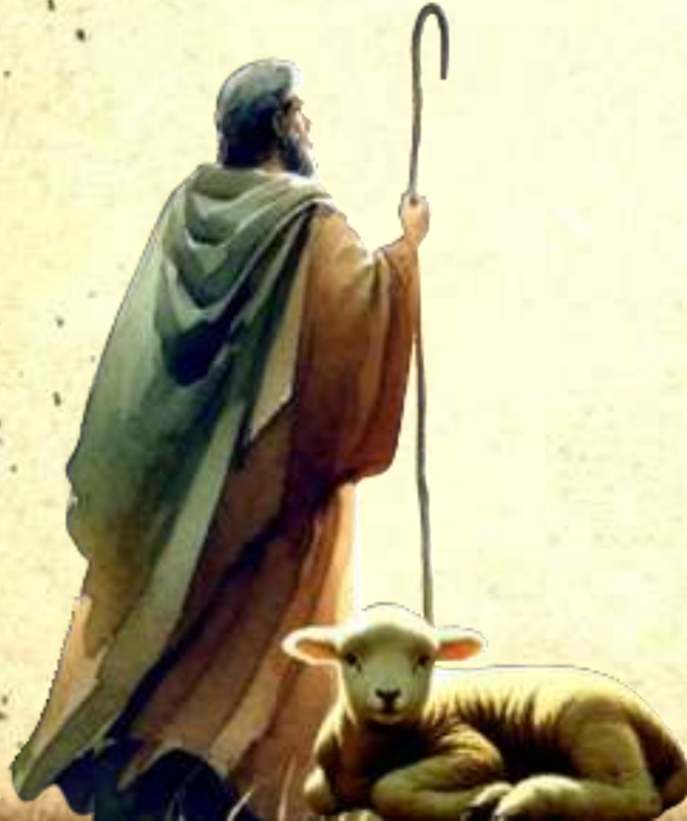
Illustration: Shepherd breaking the lamb's leg