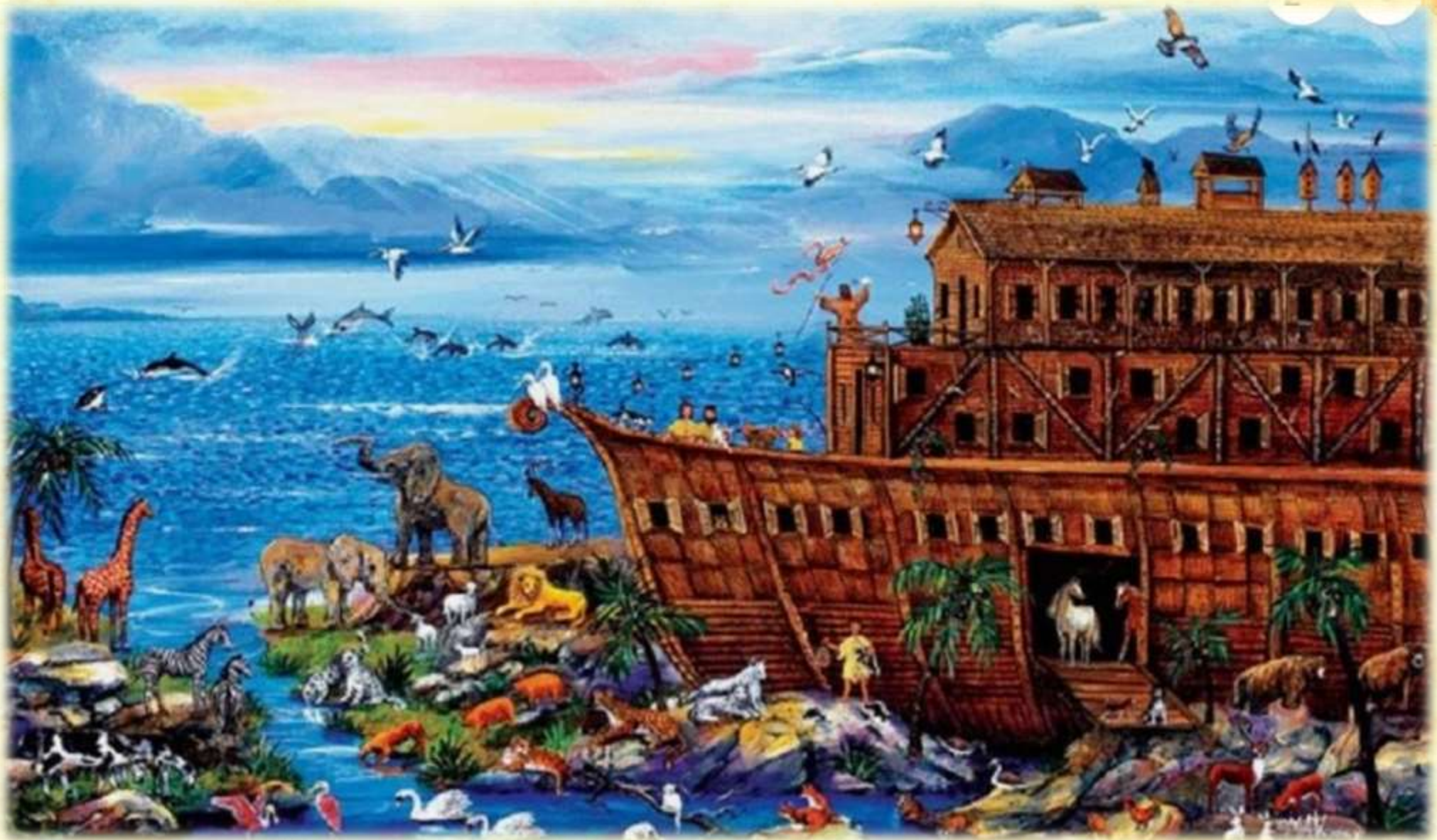
Noah and the Ark