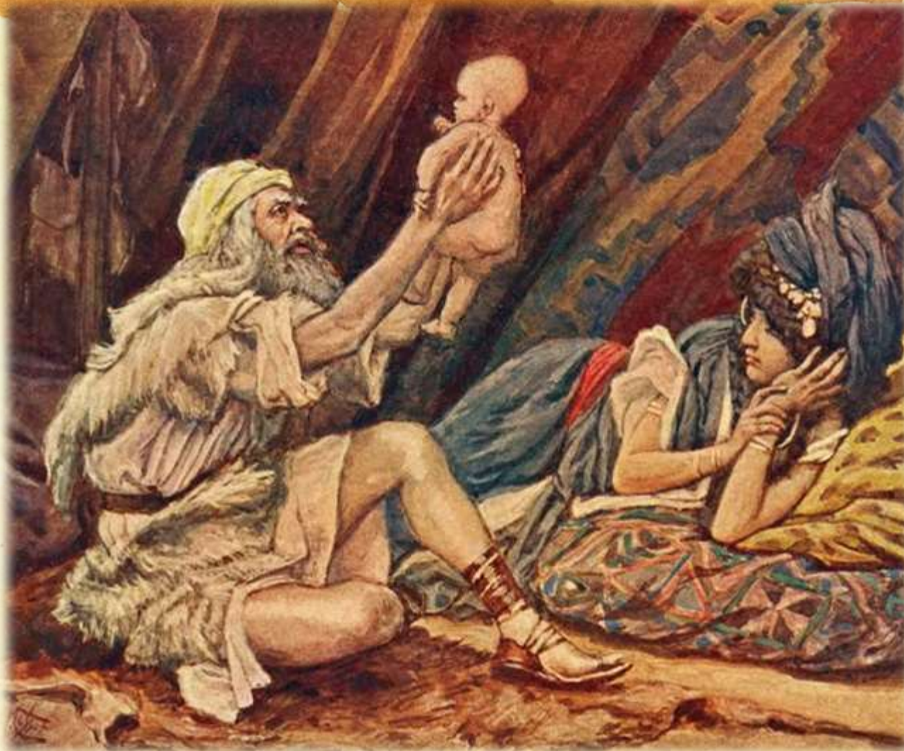
Lamech Father of Noah